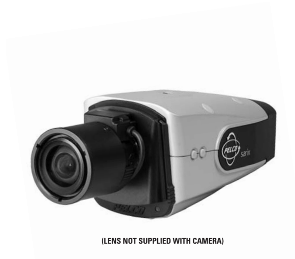
(LENS NOT SUPPLIED WITH CAMERA)

The IXS0 Series can support two simultaneous video streams. The two streams can be compressed in MJPEG, MPEG-4, and H.264 formats across several resolution configurations. The streams can be configured to a variety of frame rates, bit rates, and GOP (group of pictures) structures for additional bandwidth administration.