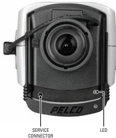
FRONT VIEW, CAMERA ONLY (OPENED TO EXPOSE SERVICE CONNECTOR)